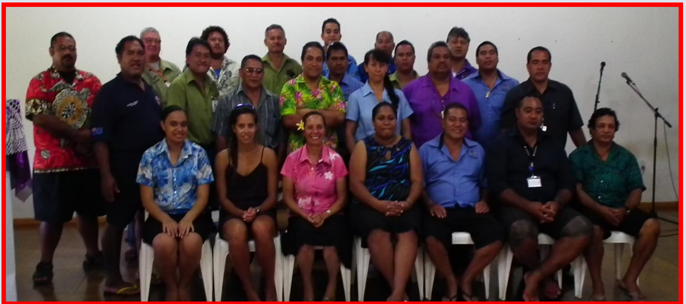
Photo (above): Health Officers from the Pa Enea were brought to Rarotonga to attend the training in vector borne disease prevention, control and water safety. This was also a week of sharing experiences between the Pa Enea and Rarotonga community Health Officers.

The MOH - VBDC project started with training of the Pa Enea Health Officers in vector disease prevention, control and water safety. The workshop was held in Rarotonga.