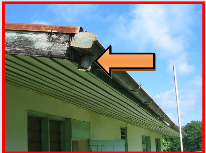
Photo: Some households repair old concrete box water tanks to increase their water storage capacity using materials that are affordable to them. Here is a classic case of downpiping falling away from the house structure. During the assessment this was seen on many homes in Atiu and Aitutaki.