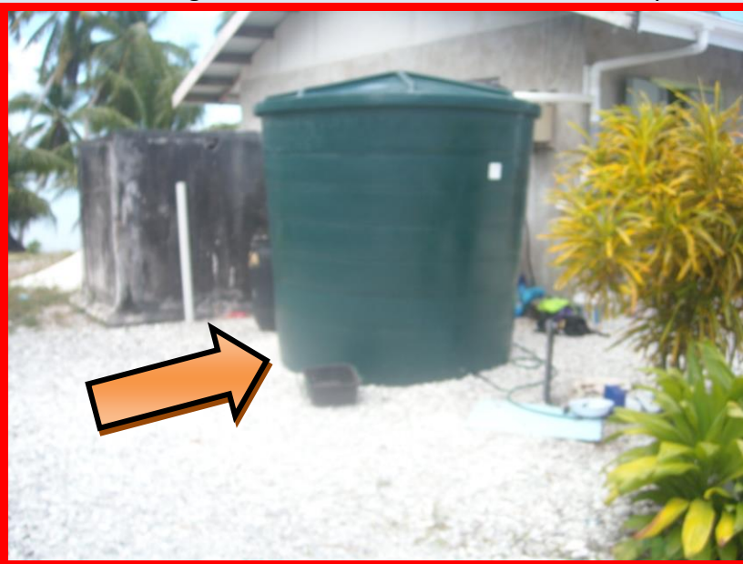
Photo: As seen with water tanks sitting on sand or soil bases...when water overflows from the tank, this erodes sand from the base causing the water tank to tilt towards the sand eroded end and eventually tearing under the strain of the unbalanced weight.