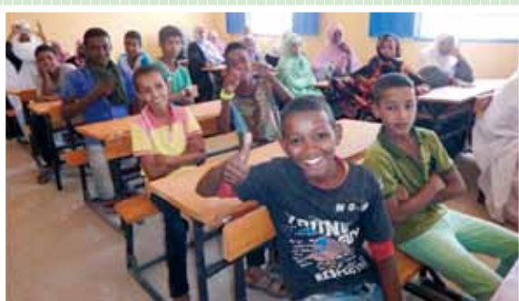
“The Project for Improving Elementary School No. 1 in Chagar CityIslamic”, Republic of Mauritania, FY2015

“Kusa” means “grass” and “Ne” means “roots” in Japanese.