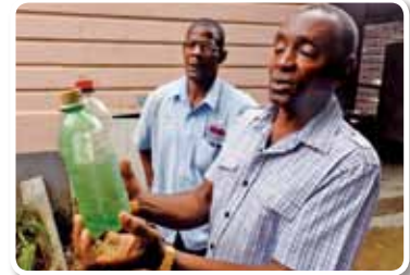
“The Project for Training for Eco-Friendly Coffee Production”, Jamaica, FY2010