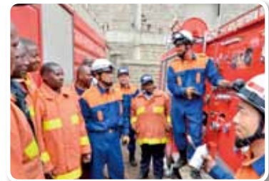
“The Project for Reusing Secondhand Fire Engine in Nairobi City County”, Republic of Kenya, FY2015