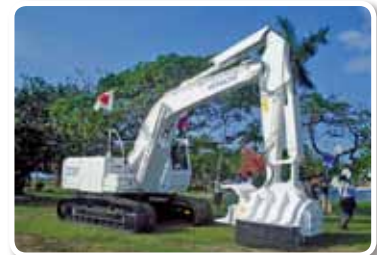
“The Project for Upgrading Anti-Personnel Landmine Removal Equipment in Meta Department and Tolima Department”, Republic of Columbia, FY2009