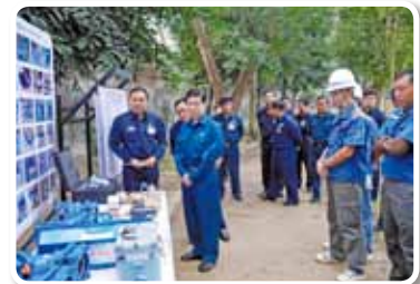
“The Project for NRW (Non Revenue Water) Reduction in Mayangon Township ,Yangon Region”, Republic of the Union of Myanmar, FY2013