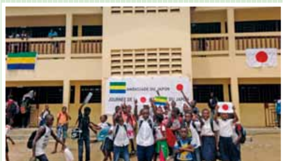
“The Project for Expanding Charbonnages Elementary School”, Gabonese Republic, FY2013