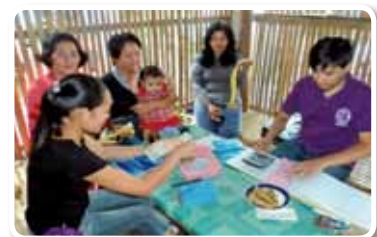
“The Project for Provision of Micro Credit Capital for Augmentation of Income and Poverty Alleviation in South Cotabato”, Republic of the Philippines, FY2010