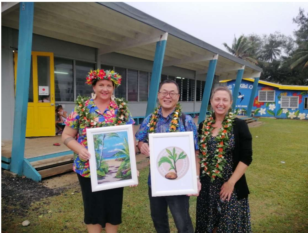
Paintings from the students of Apii Te Uki Ou Primary School and the school building Japan funded in 2015