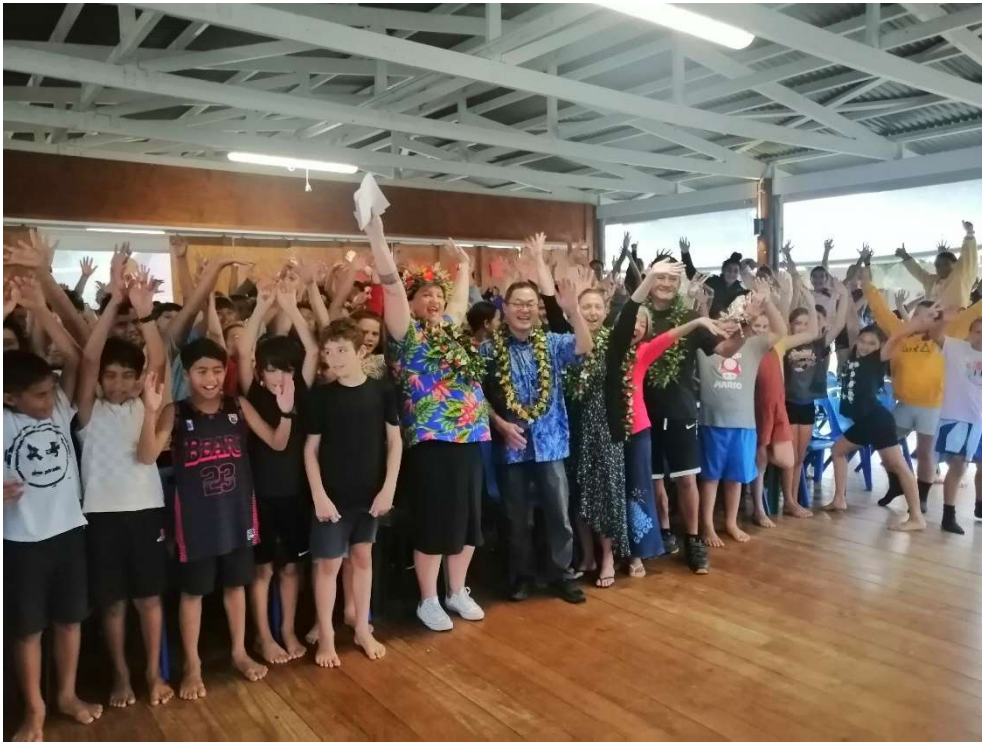
Handing over ceremony taken place in the new Multi-purpose Classroom