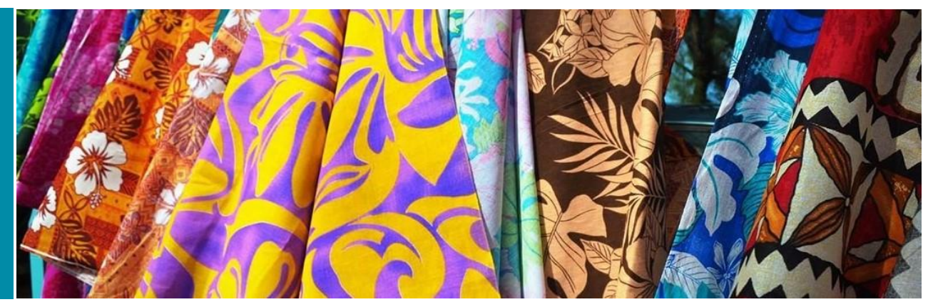
COVID-19 Economic Response Plan